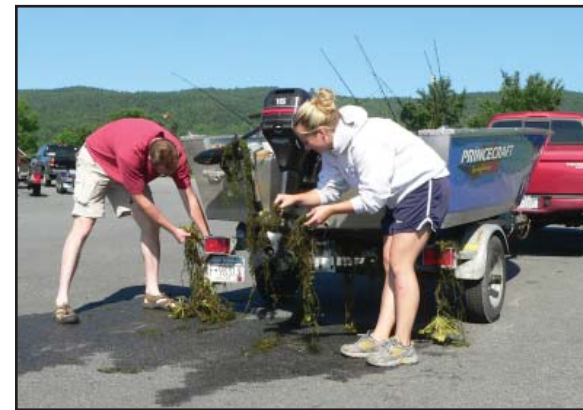
Inspect your boat, trailer and other equipment for attached plants and animals and dispose on dry land before leaving a waterbody.

Special Note to Wading Anglers: Felt-soled waders and wading shoes, which have been identified as an important means by which whirling disease spores and didymo can be transported, are difficult to disinfect. Rubber or studded soles that provide similar traction are now readily available and are much less likely to transport these invasives.